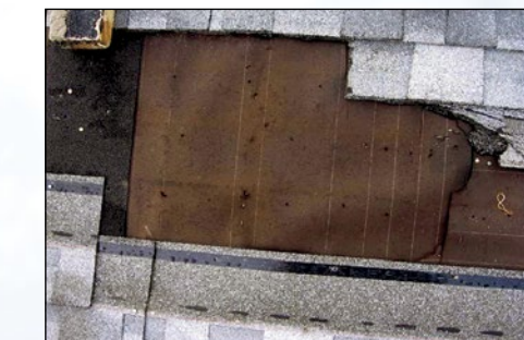
Blown-off shingles may expose your home to structural damage, mold, and mildew.

**GAF-warranted wind speeds may be less than those listed above. See GAF Shingle & Accessory Ltd. Warranty for complete coverage and restrictions.