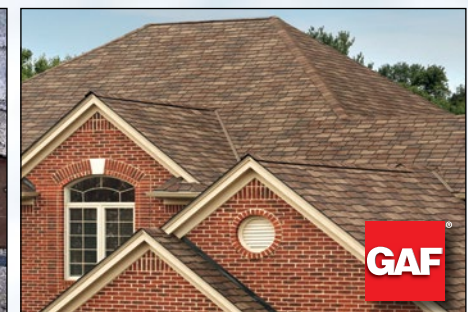
GAF Shingles with Class F and Class H wind ratings are the best choice for protecting your home.